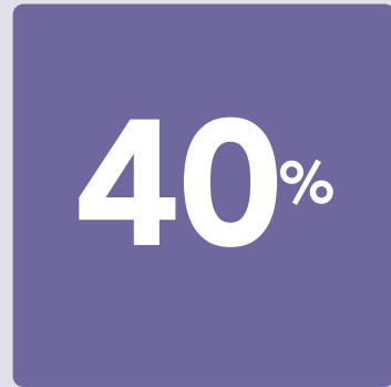
Families Enrolled in Flexible Tuition Program