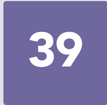
Honors and AP Classes