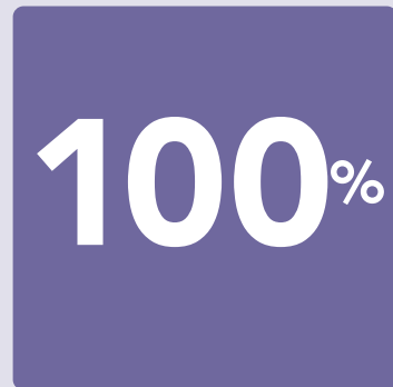
Accepted by Top 100 US Universities